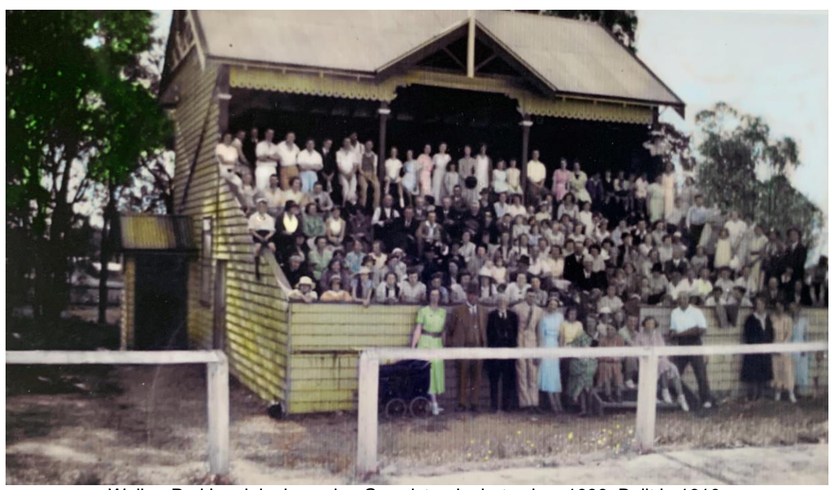
Walker Park's original wooden Grandstand, photo circa 1938. Built in 1910.