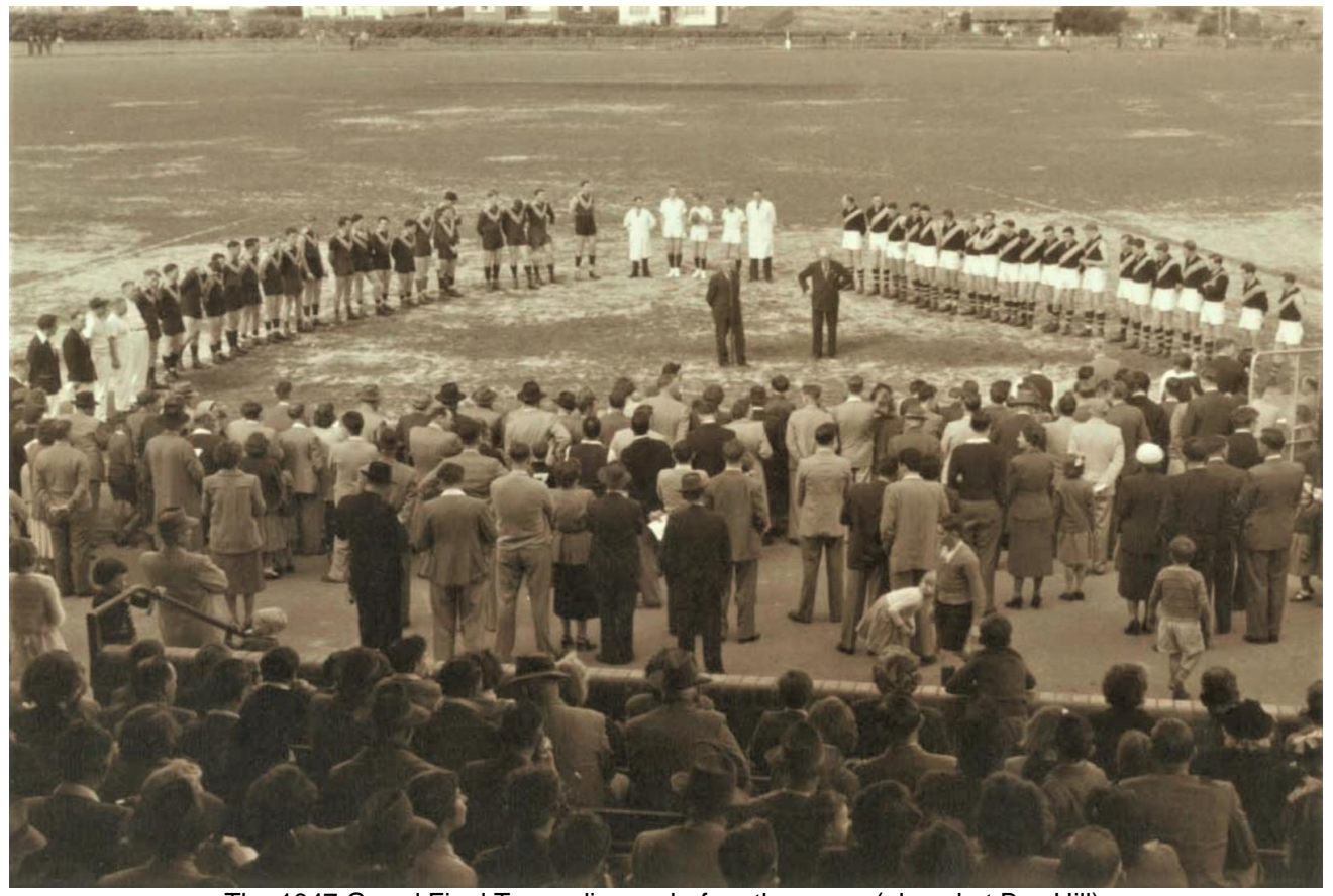
The 1947 Grand Final Teams line up before the game (played at Box Hill).

Defeated Box Hill 15.14. 104 to 15.13. 103