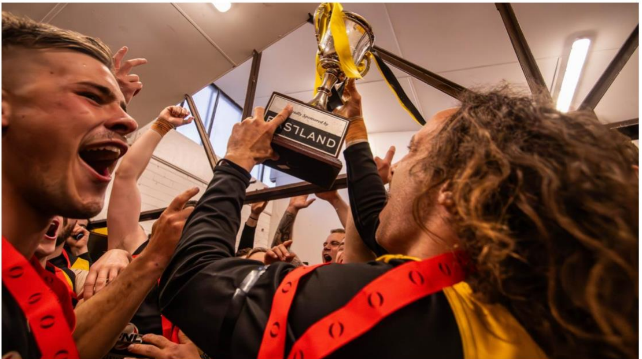
The Tigers lift a second cup in four years.

“To the boys’ credit, they really dug deep in the last quarter.”