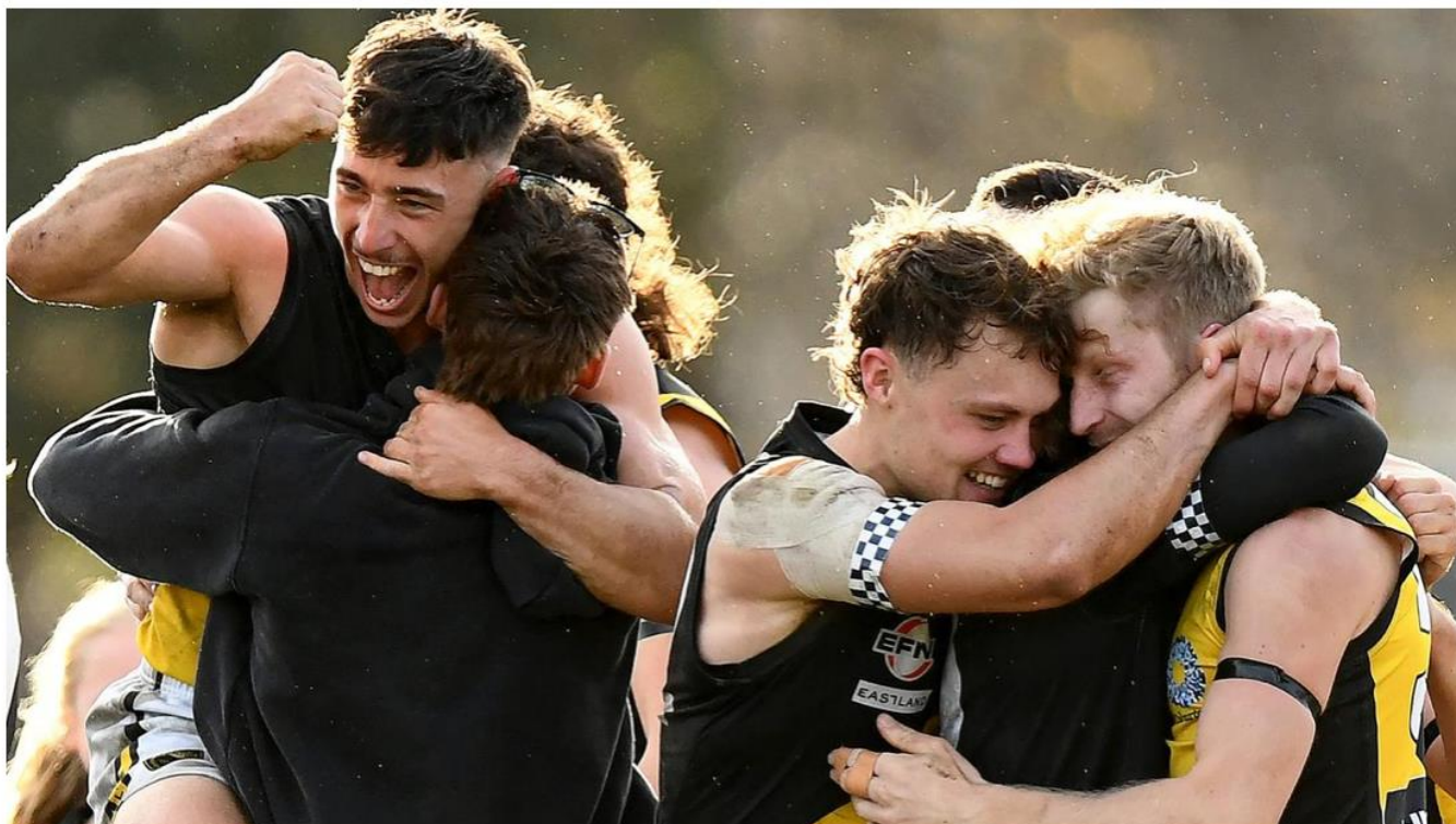
Mitcham celebrates on the siren.

The long-serving mentor pointed to his side's nine-point defeat to South Belgrave in Round 15 – which the Tigers led by 15 points at three-quarter time – as a key lesson ahead of Saturday's victory.