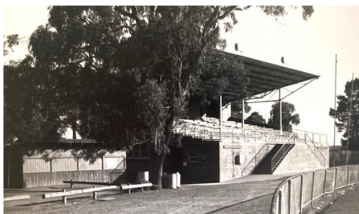
The Blue Room on the left, alongside the new Grandstand built in 1957.

When the old grandstand burnt down at Walker Park in 1955, Ray arranged, and had built the temporary change rooms plus installed his old chip heater for the showers.