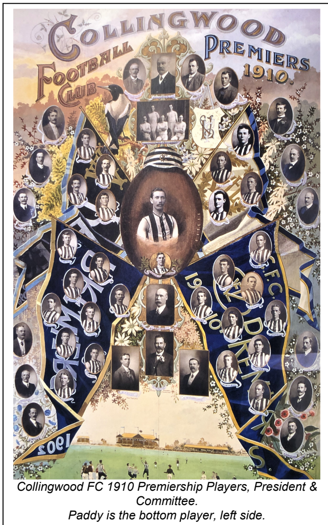
Collingwood FC 1910 Premiership Players, President & Committee.